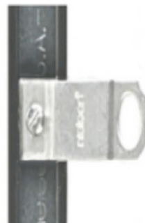
Screw in Hanger for Metal Frame