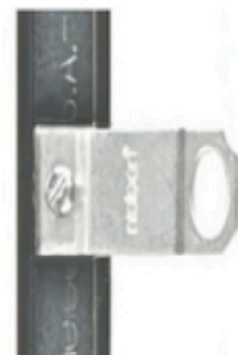
Screw in Hanger for Metal Frame